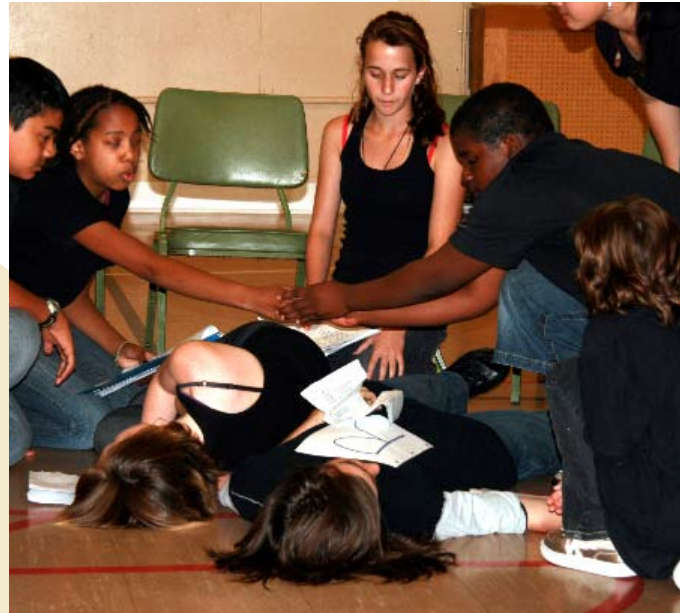
DAREarts delegates perform William Shakespeare's Romeo & Juliet at the DAREarts Summer Drama Camp.

For more information, call us at 905-729-0097.