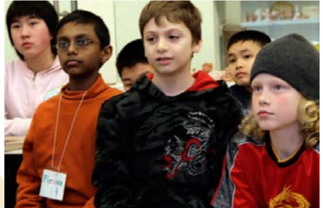
Several delegates eagerly anticipate the release of the new DAREarts website.