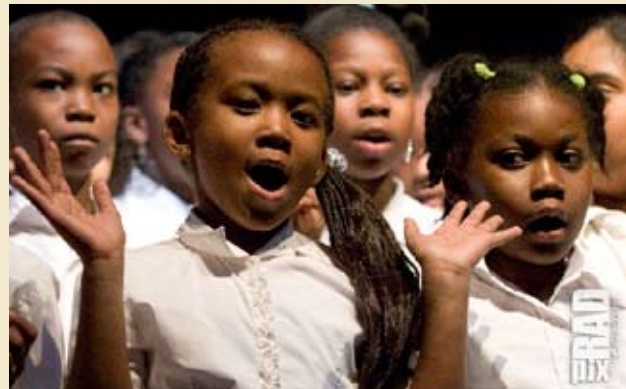
January 22 nd - DAREarts-Barry Harris Jazz Choir. See page 3.

Please make cheques payable to: DAREarts Foundation Inc. 3042 Con. 3 Adjala, RR1, Palgrave, ON L0N 1P0