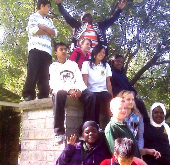
DAREarts NW1 delegates at the Festival Theatre in Niagara-on-the-Lake.