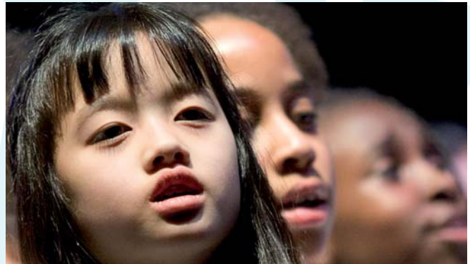
Over 400 children are taking part in this year's Jazz Choir