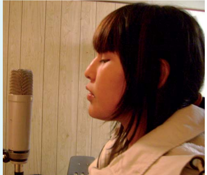
The youth from Webequie created music and poetry which was then recorded and edited