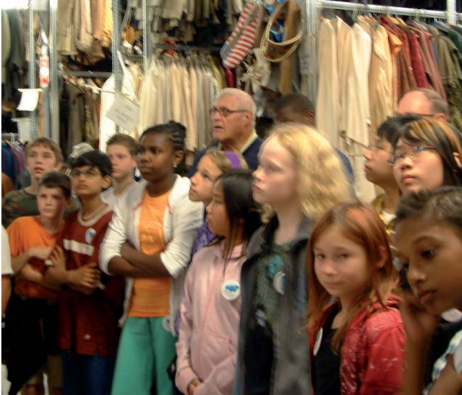
'West Side Story' bound teens tour Stratford's costume warehouse.