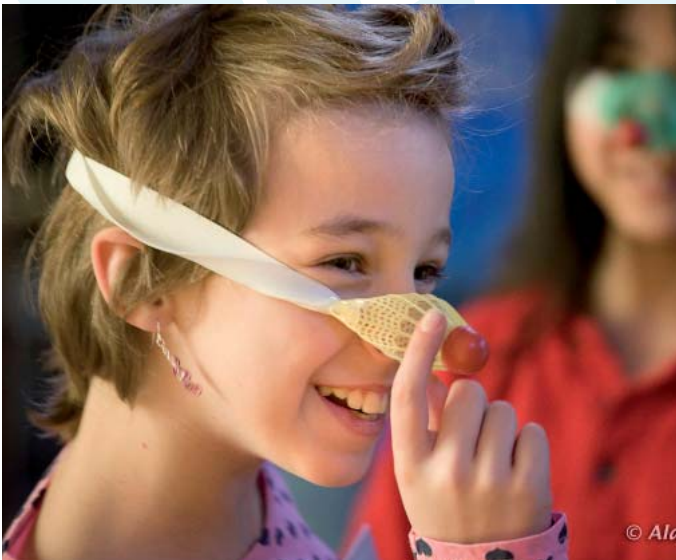
Drama exercises make everyone the centre of attention!